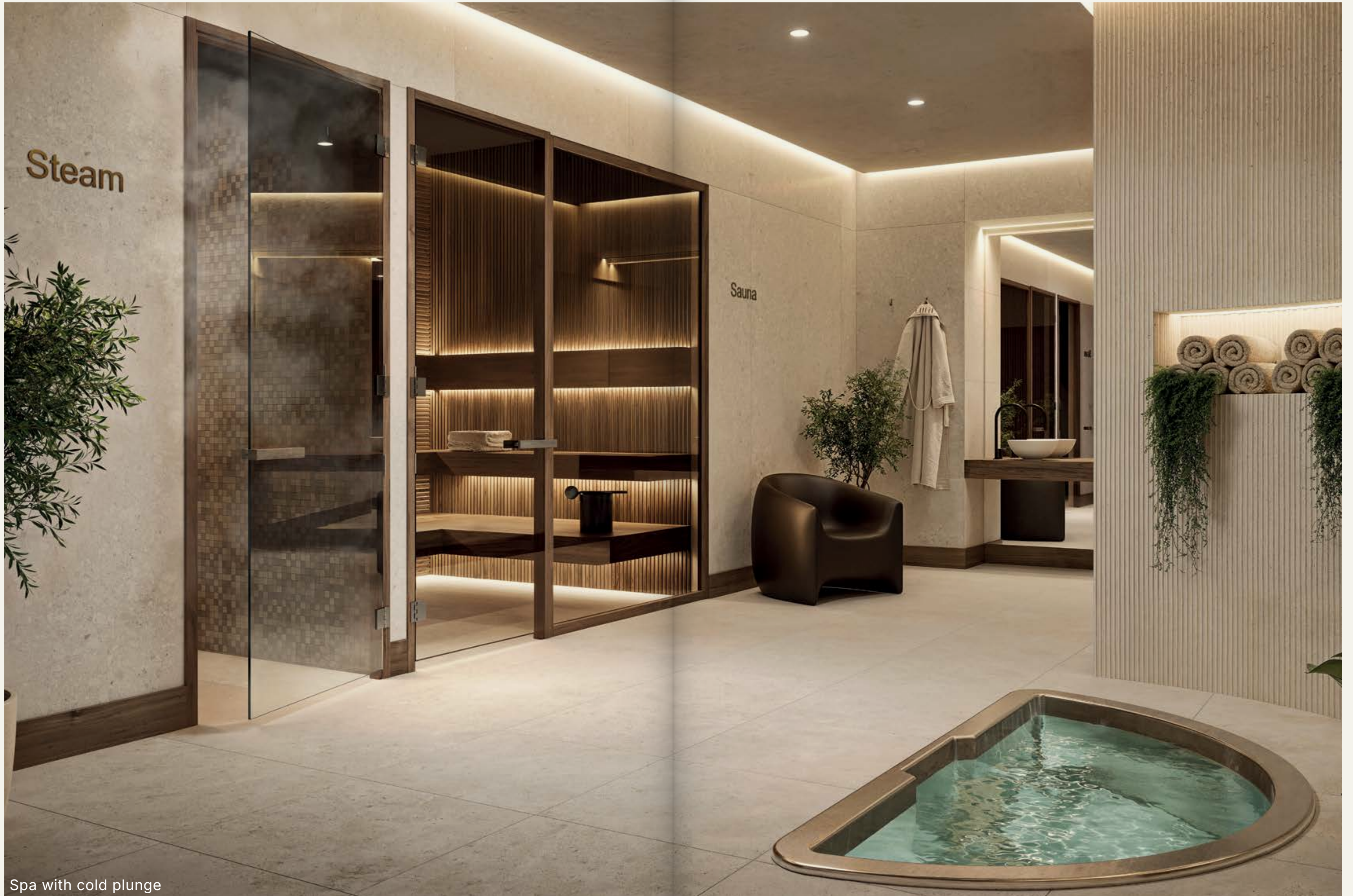
Spa with cold plunge